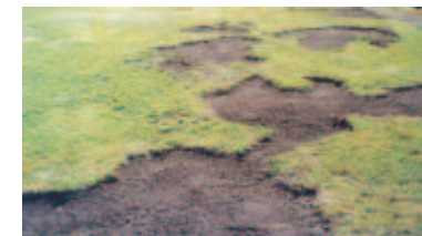
Chafer damage to lawn

In trials that have run in the UK over a two year period, MERIT® TURF on many sites achieved 100% control for up to 11 months after treatment. These sites often had populations of chafer grubs of over 1,000 per m 2 . Out of the many trials put down an average efficiency of over 80% was seen after four and a half months.