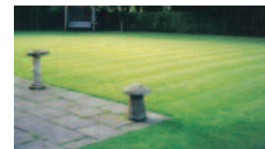
Lawn following treatment with MERIT® TURF

The active ingredient imidacloprid also produced a 50% increased greening effect and increased the grass vigour by up to 90% in treated areas.